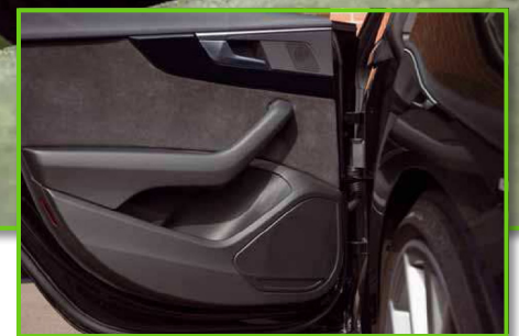
There is space at the rear for a 16-cm two-way system