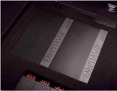
Perhaps a bit over-dimensioned: Two Emphaser ES-M4X with plenty of power