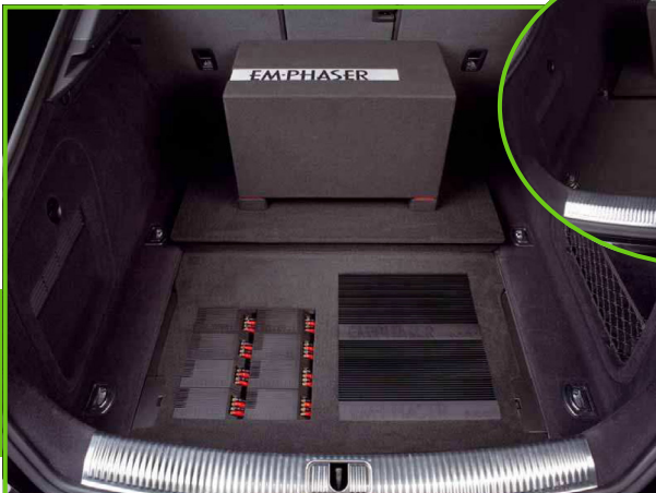
The everyday cover looks perfect as usual from ACR

listener with loads of detail information — it plays pretty darn well. And it also has some good old fashioned spatiality which should suit just fine. The reason is that the music comes wonderfully from the speakers, singers do not get ‚choked‘ and a full and warm spatiality is established. Furthermore, really universal qualities can be attributed to the system. It also works without thumping bass tones, for example when Eric Clapton and JJ Cale take to the guitar live. That perhaps is what is most impressive about the subwoofer. It blends wonderfully into the sound texture without rumbling in the background. In addition it delivers enough level for pure musical enjoyment. What rather surprised us though is the enormous low end extension with which the bass driver at just 20 cm diameter spoils the listener. In the Audi the sub delivers a clean level down into the low bass, which is a real pleasure. With snappy recorded electronic music from Yello the typical grin that is so characteristic for good sound comes back on the face.