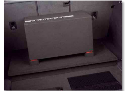
The new downfire sub is a real hit

out a careful installation. Therefore the doors have been more than adequately sound-proofed. Several layers of alu-butyl deaden them acoustically, which allows the speakers to unleash their peak performance. Most of the technology is located in the trunk, where there is space for the electronics under the cover of the false floor. For a good appearance, the crossover housings and the power amps are mounted with their top edges at the same height. This puts the trunk floor on a perfect level with the tailor made panel. That still leaves the subwoofer, which is presented as an eye-catcher in the middle of the trunk. It is located on a small pedestal, which also offsets the upward slope of the floor towards the rear seat.