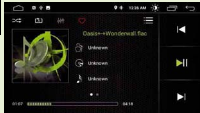
Comfortable media player controls

the car radio. Apple iPhones are also supported by Easy Connect – in this case the apps have to be controlled from the iPhone. For connecting Android phones and USB sticks by cable, the devices provide three USB sockets. An HDMI input is also available. In addition to the usual AV inputs and outputs the R-D111 and R-D211 have two camera inputs with a switched power supply.