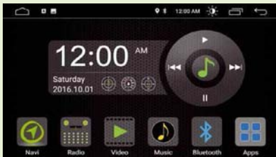
The main menu is clear and well laid out