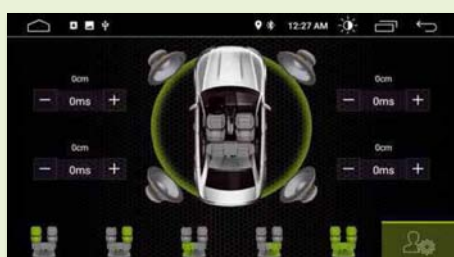
Intuitively adjustable time alignment

Where Android smartphones are connected to the Radical devices via Wi-Fi, you can mirror the content of the phone on the moniceiver using the Easy Connection app. In fact you can then control the apps from the touchscreen of