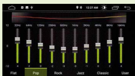
10-band graphic equalizer