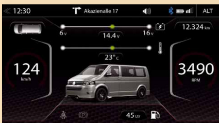
Displaying the vehicle parameters

The Z-E2060 offers the same generous features and functionality as for the Golf model. Beside analog FM recep-