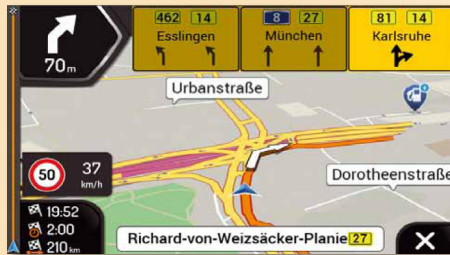
Navigation with display of traffic signs