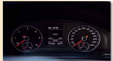
The multifunction display of the T5 is supported

tion, the Zenec also can also control modern DAB+ digital radio which is developing more and more into a European broadcasting standard. Two USB inputs are provided at the rear for playing music stored on sticks, Android smartphones and iPhones. Naturally there is also a Bluetooth wireless connection for smartphones. for conveniently dealing with phone calls as well as wireless audio streaming. A CD/DVD drive is also provided.