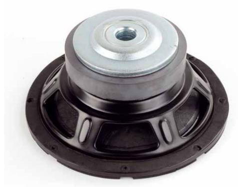
The 20 cm woofer with paper cone and metal basket is of robust construction

a bass reflex subwoofer the size of the chambers and the dimensioning of the port determine the frequency response, characteristic sound pressure level and