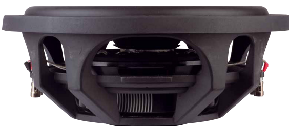
A spacer locates the centering spider between pole plate and cone

MW 10 Flat and MW 12 Flat with their powerful design and tuning belong to the elite class of subwoofers with little installation depth. Here you have serious bass, but in flat packaging.