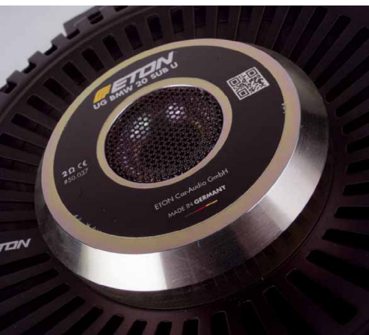
The woofer comes with a possibly record-breaking neodymium driver and 64 mm voice coil

The Upgrade BMW Ultimate speakers are the best choice if you want to treat yourself to something really good in your BMW. Obviously the fun doesn't come cheap, but for that you get extraordinary quality.