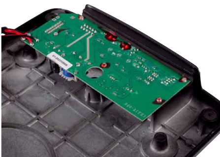
Slim signal circuit board with small power supply transformer and amplifier chip.

seat: they also look very good in the footwell or in a motorhome, where they find a place behind a panel or in one of the numerous cavities. Connecting the Eton units is extremely simple: all that is necessary is a single Molex-plug that, together with the cable harness, supplies power and the high level signal. If you have a low level signal in the vehicle, then it can also naturally be fed in via a Cinch signal cable. The subwoofer housing has controls for sensitivity, low pass and phase. A cable remote gain control is included so handling the USB woofers is made very simple. Even the remote cable can be left out. On most car radios the subwoofers switch themselves on and off automatically. Our two test candidates are the USB 8 AR and the USB 10 AR, which are differentiated by the size of