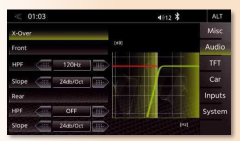
Setting the crossovers