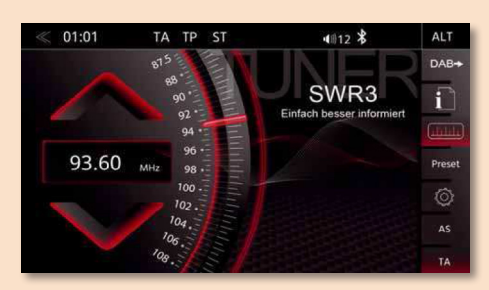
FM analog radio source

Beside a USB connection you can also pair phones wirelessly over Bluetooth. This provides comfortable hands-free calling from the car radio, as well as audio playback via A2DP. As desired, you can talk using the microphone built into the front or the external microphone supplied. Calls can be made in comfort from the phonebook or the call list. A number can also be input manually via a ten digit numeric keypad. The large touchscreen offers ample