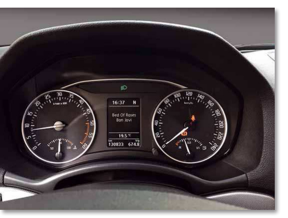
Control of MFA multifunction display