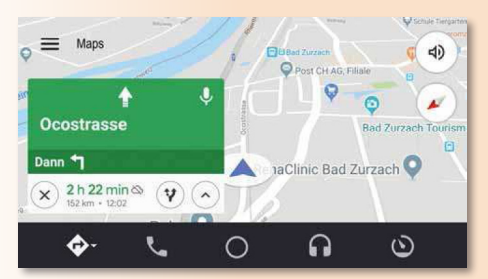
Navigation with Google Maps