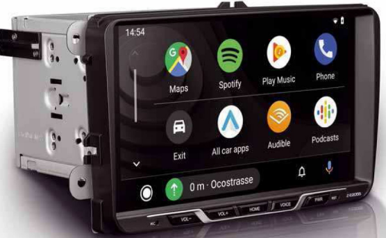
buttons to red or white.