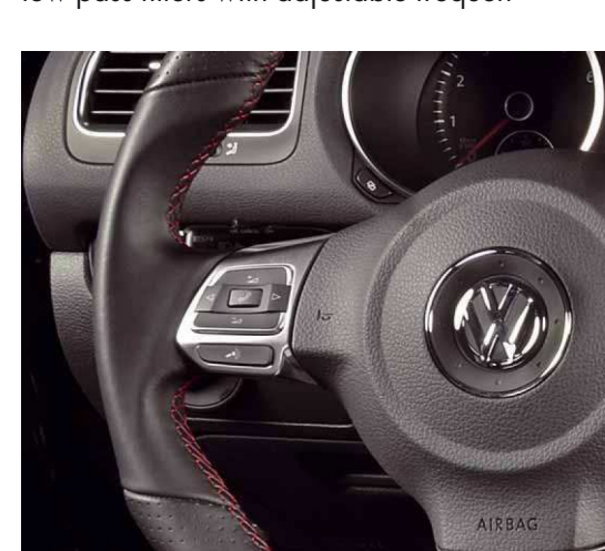
Multifunction steering wheel interface

low pass filters with adjustable frequen-