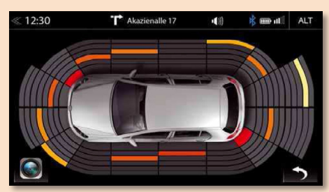
Parking System OPS