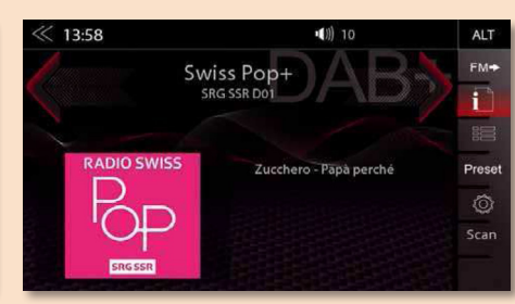
DAB+ digital radio with large Slideshow display