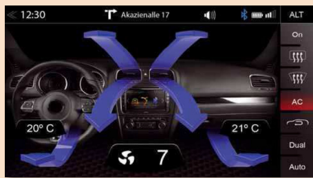
Automatic Climate Control