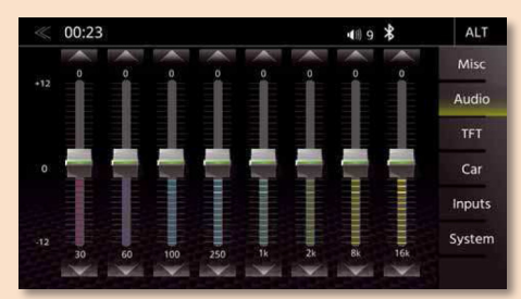
8-band graphic equalizer