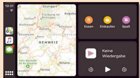
Apple Car Play via USB port